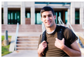
College & University Students